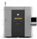
sPro 60 SD