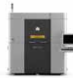
sPro 60 HD-HS