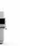
sPro 230 HS