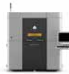
sPro 60 HD Base